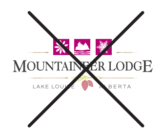
DO NOT SUBSTITUE COLOURS. USE ONE OF THE MANY COLOUR OPTIONS PROVIDED